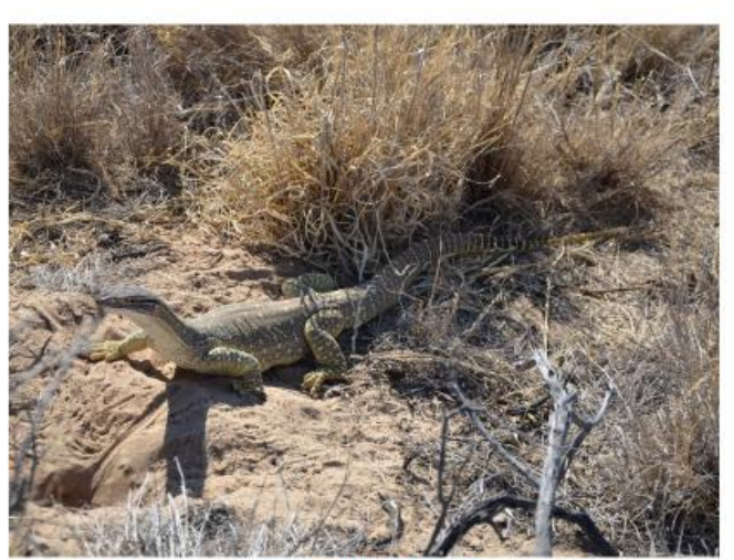
Sand Goanna (Varanus gouldii)